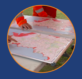
Prepare tsunami evacuation plans for your home, business and properties that are within tsunami risk areas, and make sure you plan for all people and animals in your care.