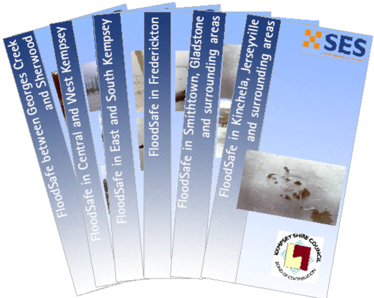
Figure 1 - Tailored FloodSafe Brochures

The FloodSafe guides give a brief outline of the nature of the flood problem in the area. Including, where appropriate, key gauge heights at which levees are overtopped or evacuation routes are cut. They also give general flood safety advice and any information that is specific to the management of flooding in that area (Figure 2).